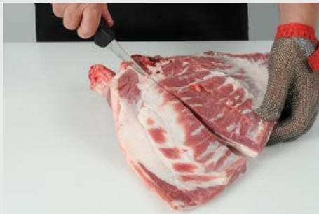
5. Remove the breast tip.