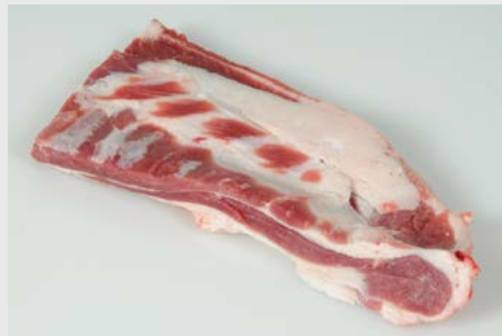
6. Remove excess fat and lay 3-4 trimmed breast tips on top of each other...