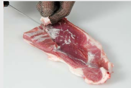
7. ...facing opposite sides. Roll using string or netting to secure.