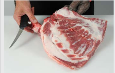
4. ...leaving the neck fillet attached to the bone.