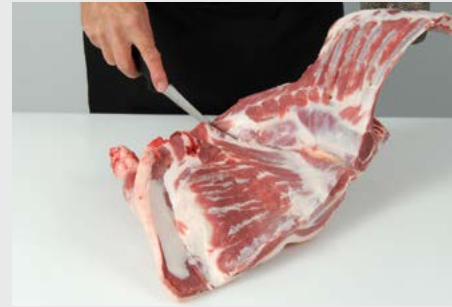
3. Sheet bone the ribs...