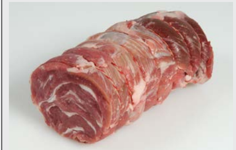
8. Lamb Brisket Joint.