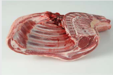
2. The forequarter of lamb.